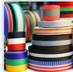
Narrow Width Tape