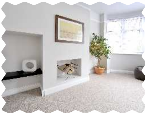
WALL TO WALL CARPETS